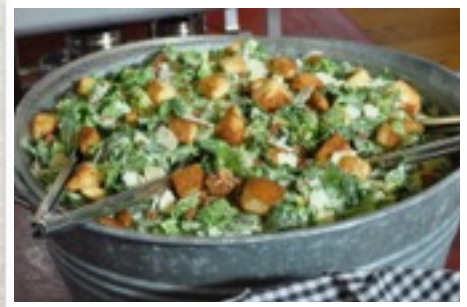
Lynnwood's Caesar Salad

ADDITIONAL FEES 18% STAFF CHARGE / 5% GST