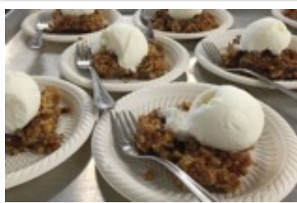
Warm Apple Crisp with Ice Cream