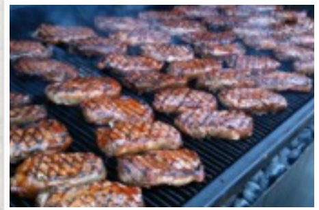
AAA New York Steaks 8 oz

All prices are per person. Please request a quote for your event. We can personalize your Menu.