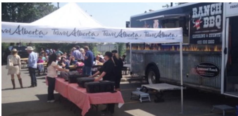
Stampede Event 2015